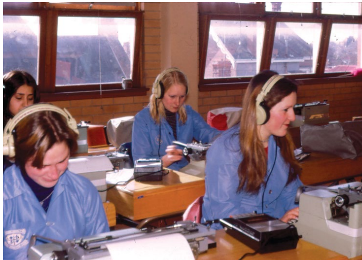
Typing from Dictaphone.

In 1966, the Mary Ward Wing was completed at Mary's Mount with extra classrooms, dining room, dormitory, kitchen, tuck shop and shower block. The old St Cecilia's Hall, the Infirmary Cottage and music rooms were demolished to make way for the Mary Ward Wing and the redesigned oval. In 1975, the Gonzaga Barry Centenary Wing was built with the Antoinette Hayden Library, science laboratories, music department and the multi-purpose hall.