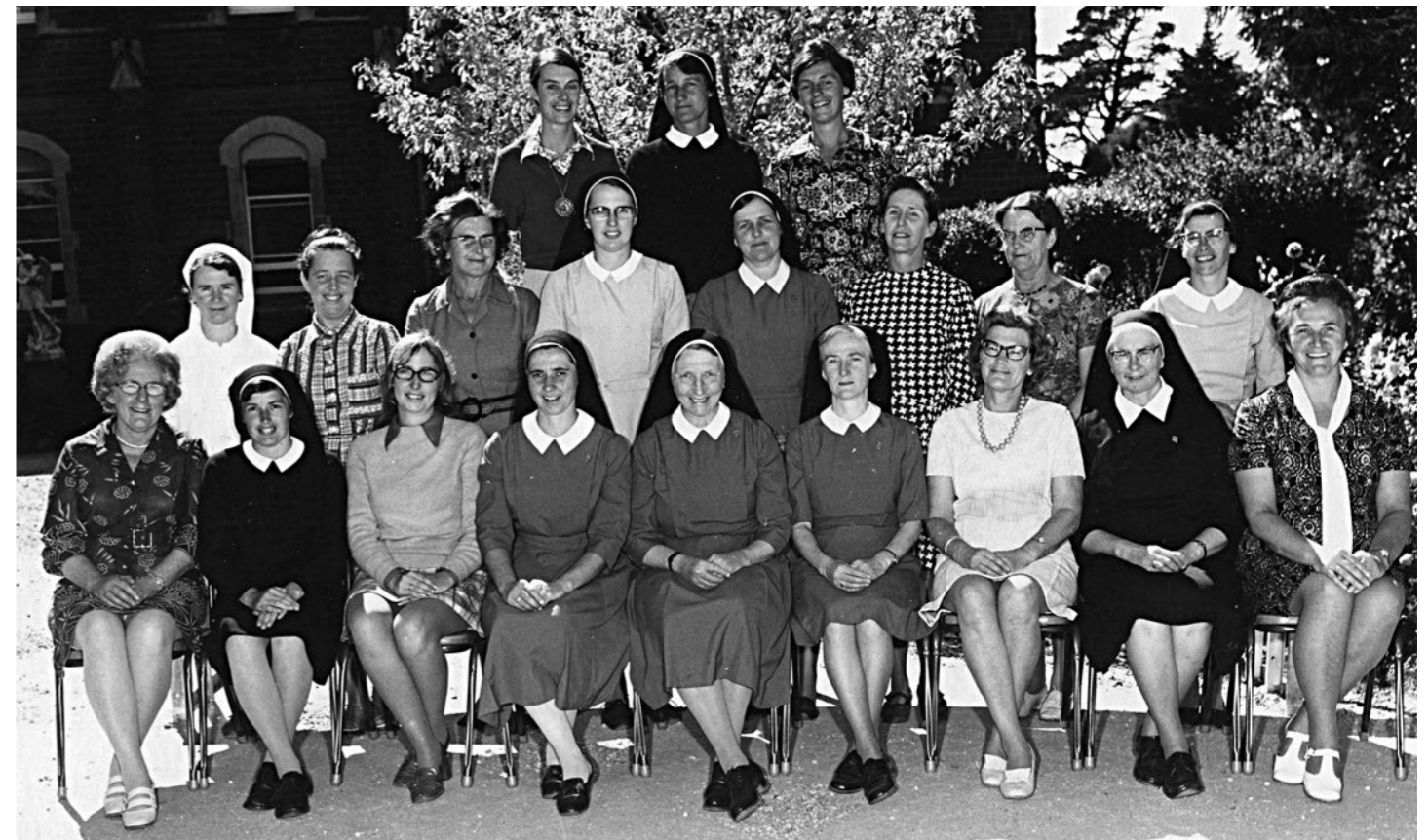
Mary's Mount Staff 1974