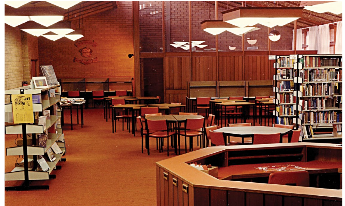
The Antoinette Hayden Library

“the educational philosophy established in Australia- through to – remains at the heart of the College.”