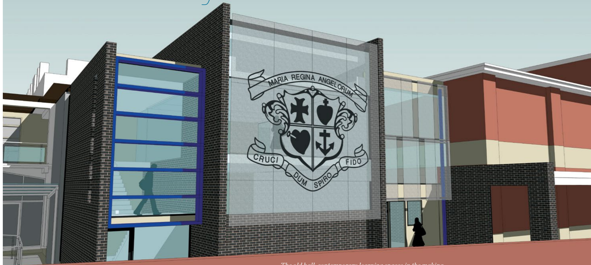
The old hall; contemporary learning spaces in the making.

Loreto College Council, in its governance role, has a major responsibility of ensuring our school continues to grow and provide a full and comprehensive education for each and every student. A key objective for the Council is therefore high level strategic planning. This year has seen major projects associated with strategic goals in the areas of the Performing Arts and the addition of an extra stream, which commenced in 2012, brought to completion or currently being brought to completion. The Mary's Mount Centre is a state-of-the-art facility with a 500 seat theatre, ensemble room, studios and multi-media lab. The