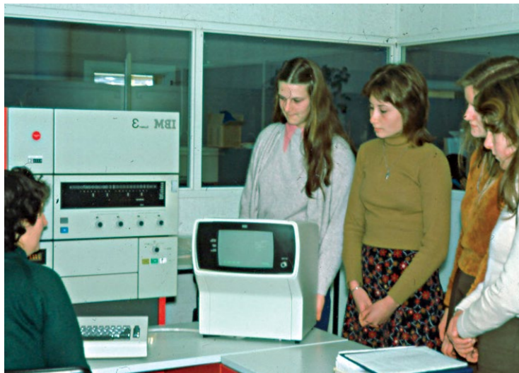
Commercial College computer room.

“the educational philosophy established in Australia- through to – remains at the heart of the College.”