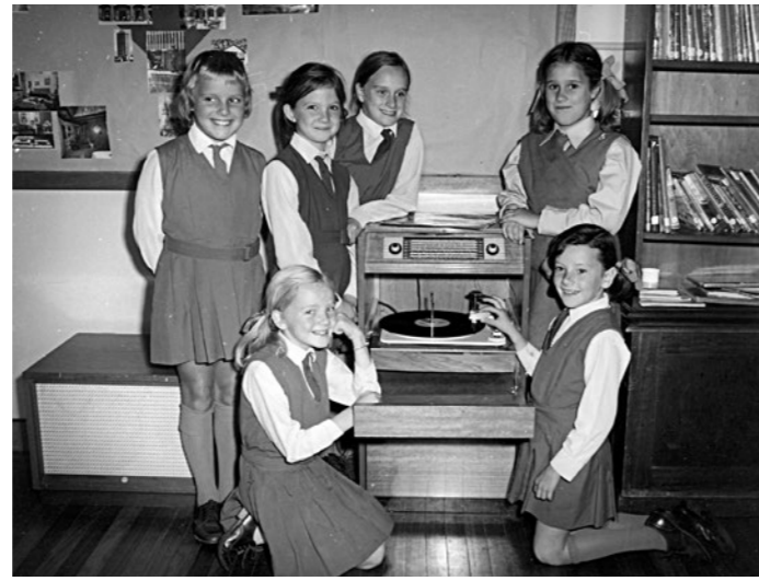
Mary's Mount Junior School students 1970s.

At Mary's Mount, profound structural change was taking place to accommodate the expanding demand for local education. The kindergarten, opened in the 1940s, was expanded in the 1960s with new wings to the building and the extension of the playground.