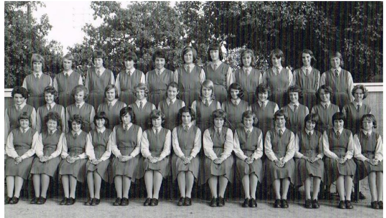
FORM 4, 1965

"I will give Him what I have; and all that I need I will find in Him; and in humble self-surrender I will wish for what His providence arranges for me..." (Retreat notes, Mary Ward 1619)